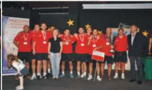
Award winning team more large